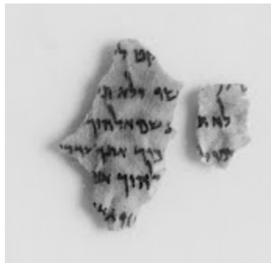
Fig. 2: 4Q367 frags. A and 2b capture from PAM 43.043